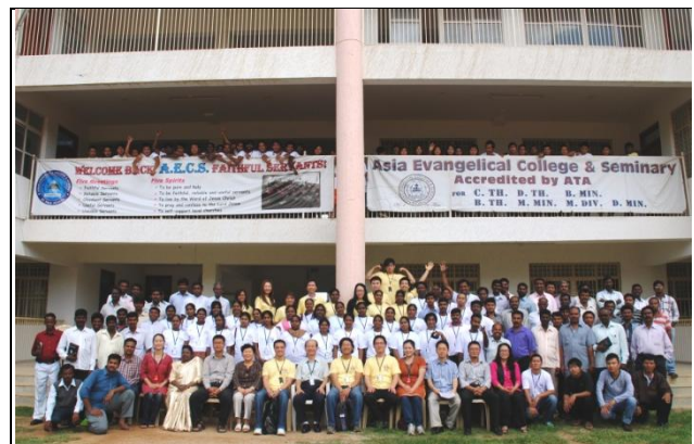
AECS is a wonderful place to build friendship in Christ