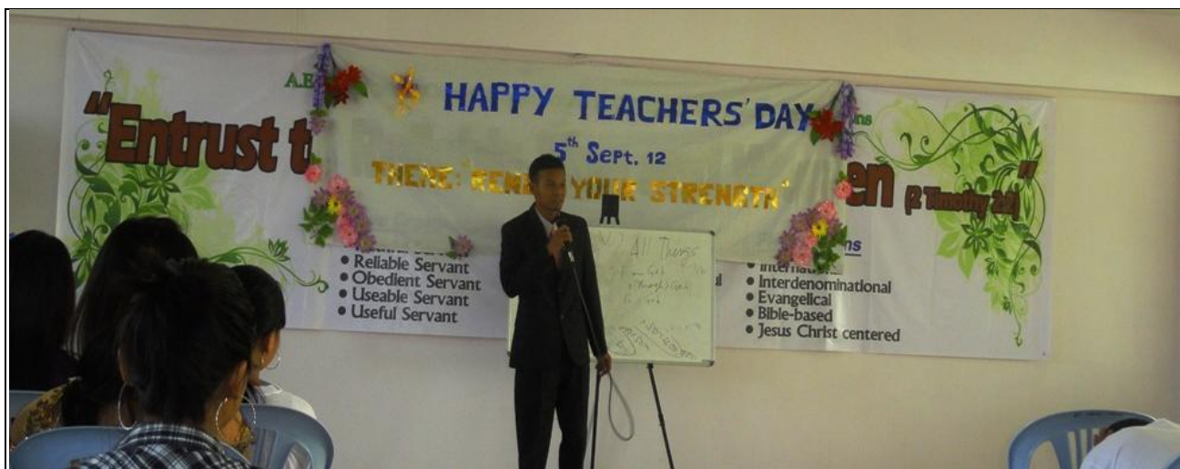
Teaching and administrative faculty members are well respected and appreciated at AECS