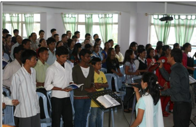
Morning Devotions & Worship Services are daily offered-up